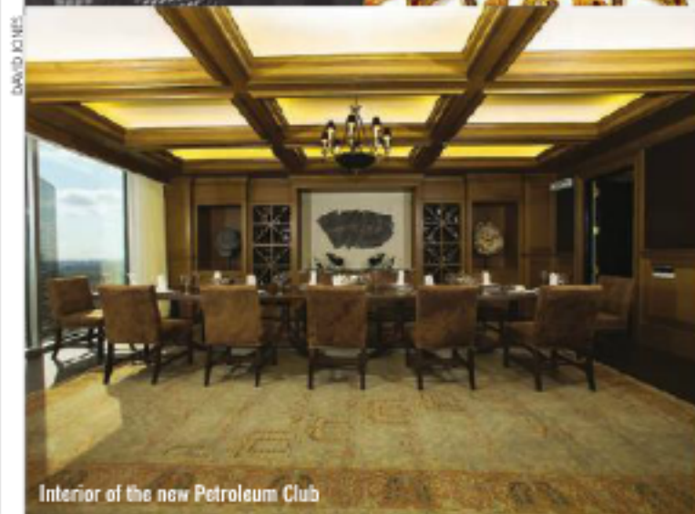
Interior of the new Petroleum Club