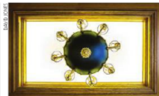
Left: Lighting detail at Petroleum Club's new space in Total Plaza