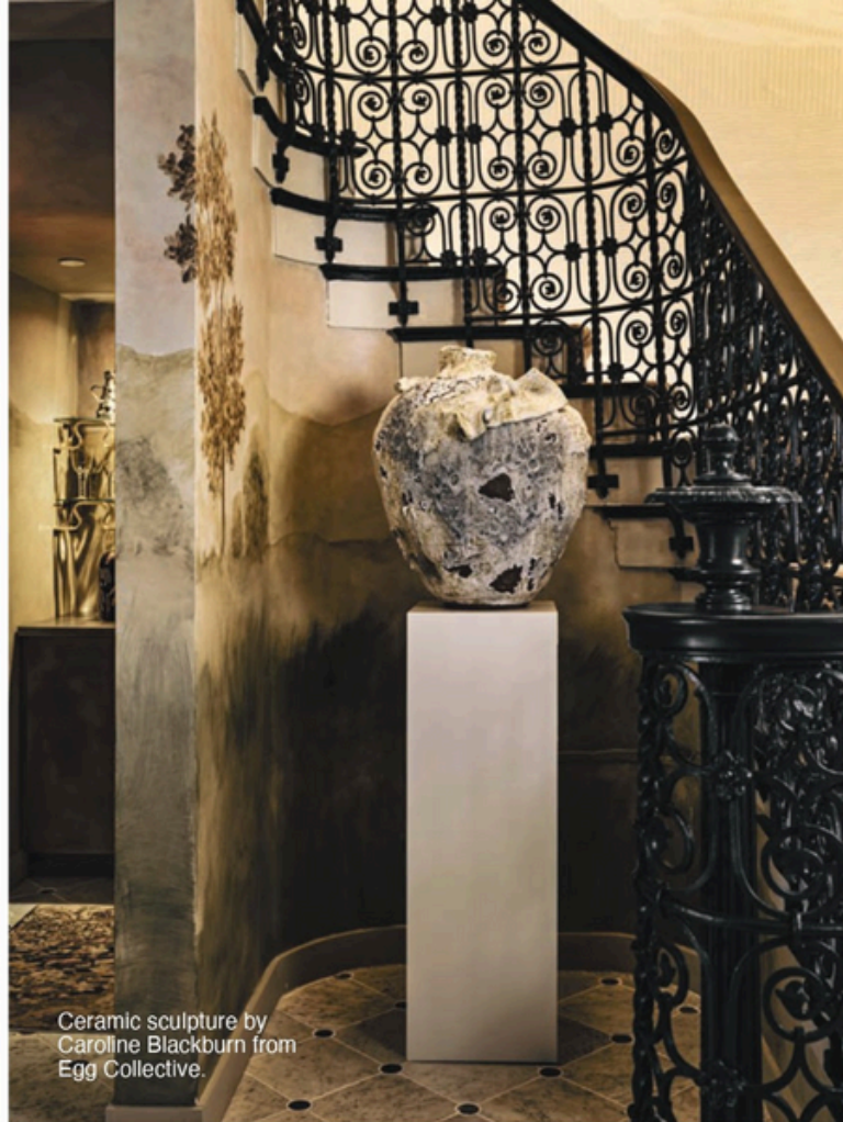
Ceramic sculpture by Caroline Blackburn from Egg Collective.

In the powder bath, Kohler bronze faucet and smoked-glass sconces by Apparatus Studio. Vintage asymmetric brass mirror. Antique Belgian slate sink from Chateau Domingue. Lime-plaster walls in a custom rouge color by Domingue Architectural Finishes.