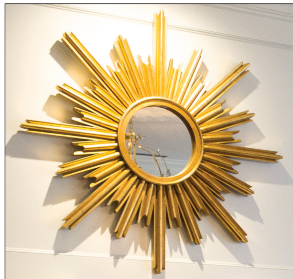
This sunburst mirror also adorns the Reception Area above the fireplace.